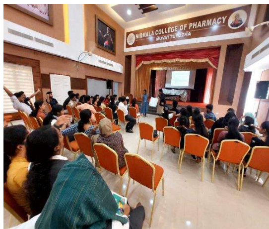
Students were presenting and developing various innovative ideas and activities

thinking. The topic includes both theoretical and activity-based sessions. Students were actively involved in the session by presenting and developing various innovative ideas and activities. The trainer includes the stories and incidents of inspiring innovations that happened all over the world in his session.